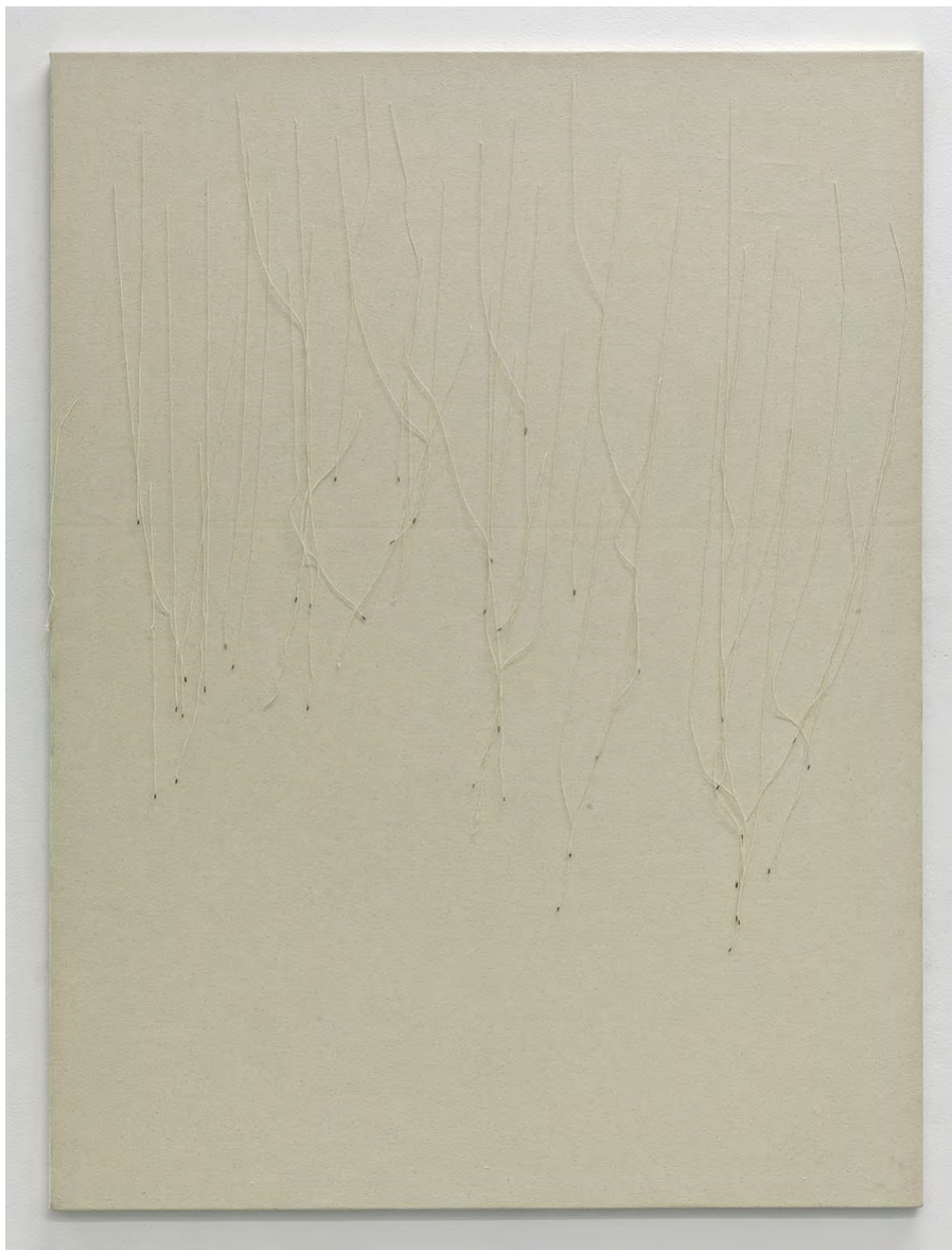
Art courtesy of Aleksander Hardashnakov untitled 23 string piece 2 , canvas string and enamel on canvas (122 x 91 centimetres).