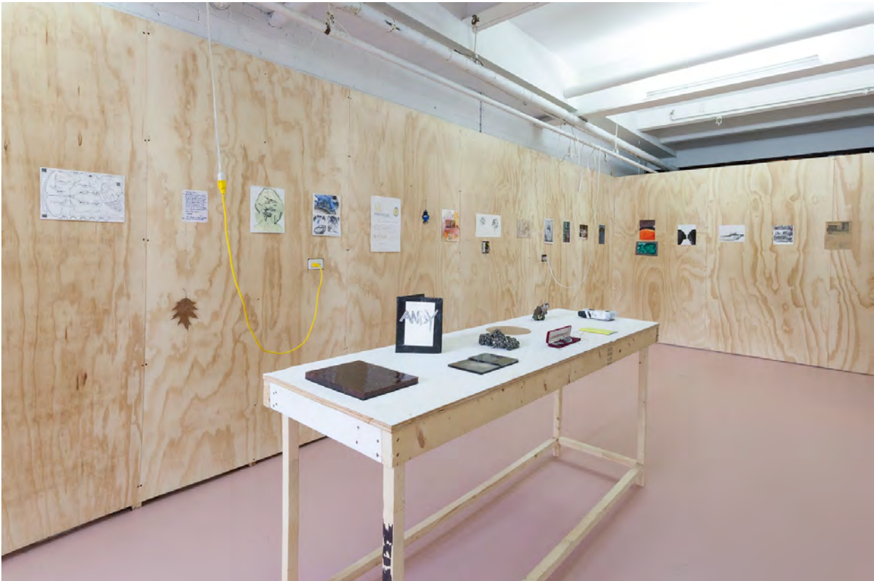
"The Humane Society" at the Loon.

In the last few years, a new generation of project spaces dedicated to supporting emerging artists has cropped up in Toronto—in basements, commercial buildings and, in one case, an old air-conditioner repair shop.